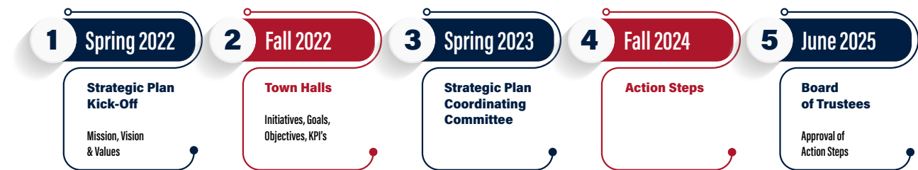
Figure 1: District Planning Process Timeline Graphic

As part of this process, SRJC reimagined its broader District planning structure to ensure strong alignment and coordination across the institution. The Strategic Plan functions as the single, central framework that guides all institutional priorities. Education and student services planning are directly connected to the Strategic Plan's initiatives, ensuring academic priorities are clearly embedded in the College's direction. Operational plans—such as Facilities, Technology, Staffing, Sustainability, and Strategic Enrollment Management—are aligned in support of these priorities. This integrated, student-centered approach reinforces SRJC's core educational mission and ensures that student success remains the focus of planning across all areas of the institution.