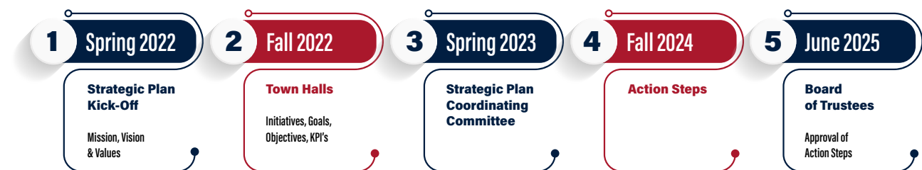
Figure 1: District Planning Process Timeline Graphic

As part of this process, SRJC reimagined its broader District planning structure to ensure strong alignment and coordination across the institution. The Strategic Plan functions as the single, central framework that guides all institutional priorities. Education and student services planning are directly connected to the Strategic Plan's initiatives, ensuring academic priorities are clearly embedded in the College's direction. Operational plans—such as Facilities, Technology, Staffing, Sustainability, and Strategic Enrollment Management—are aligned in support of these priorities. This integrated, student-centered approach reinforces SRJC's core educational mission and ensures that student success remains the focus of planning across all areas of the institution.